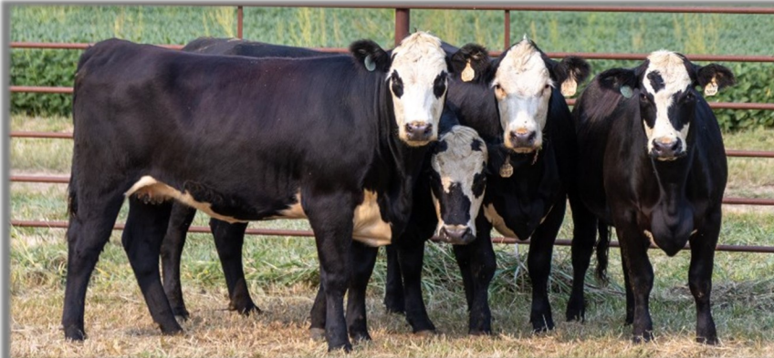
Lot 74 A-D: 4 head – F1 Hereford x Angus 50/50, Black Baldies