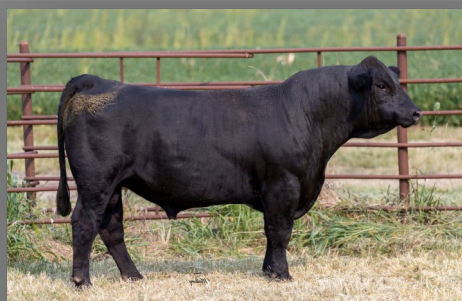
LOT 60: T-T TAKE ON H16