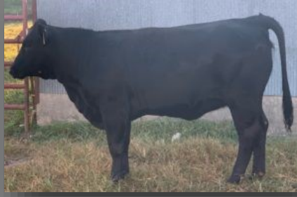
Lot 71F: Miss Audie H727