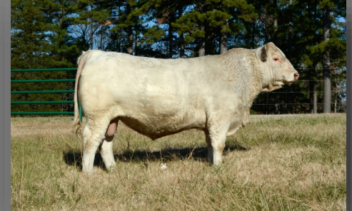
REFERENCE SIRE OF LOTS 27- 29: SAT SUNDANCE 5113