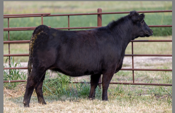
Lot 75 A- G: 7 head- Simangus Bred Heifers