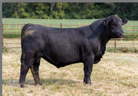
LOT 56: T-T DOUBLE DOWN H22