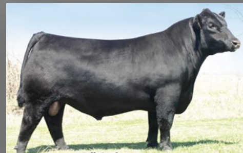
SIRE OF LOT 59: BC LOOKOUT 7024