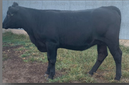
Lot 70F: Miss Hickock H713