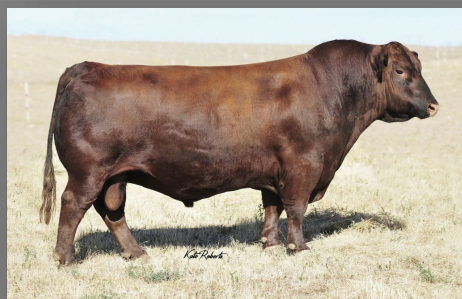
SIRE OF LOT 52: ANDRAS FUSION R236