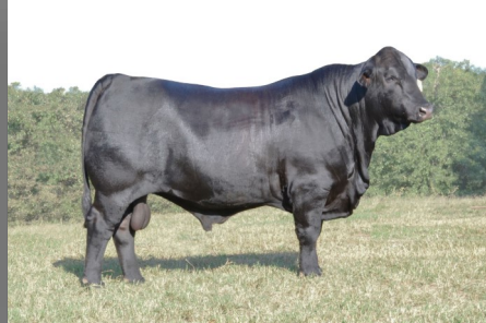
SIRE OF LOT 23: DMR LOUISIANA PURCHASE 924D10