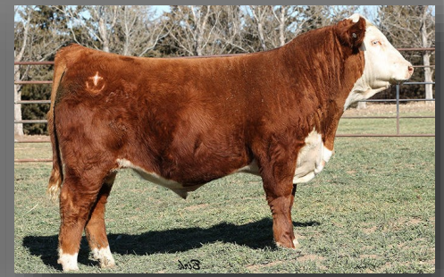
SIRE OF LOT 46: SHF EVERSTONE Z311 E156