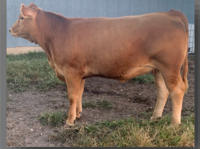
Lot 73F: Miss Lily H731