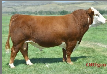
SIRE OF LOT 39: CHURCHILL RED BULL 200Z