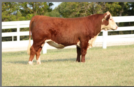
Lot 33: BB104H