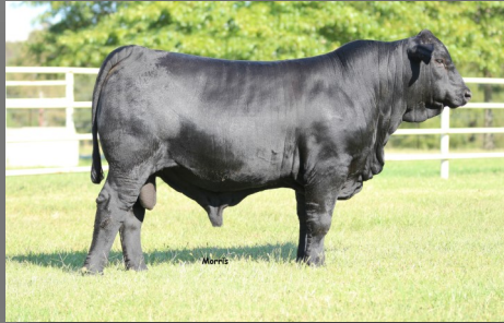
SIRE OF LOT 22: DMR ELDORADO 30B15