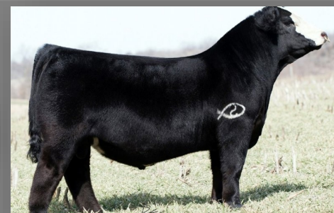
SIRE OF LOT 62: SHOOLEY EMMETT C543